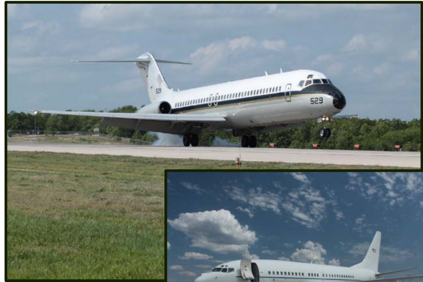
Forney Field, Fort Leonard Wood